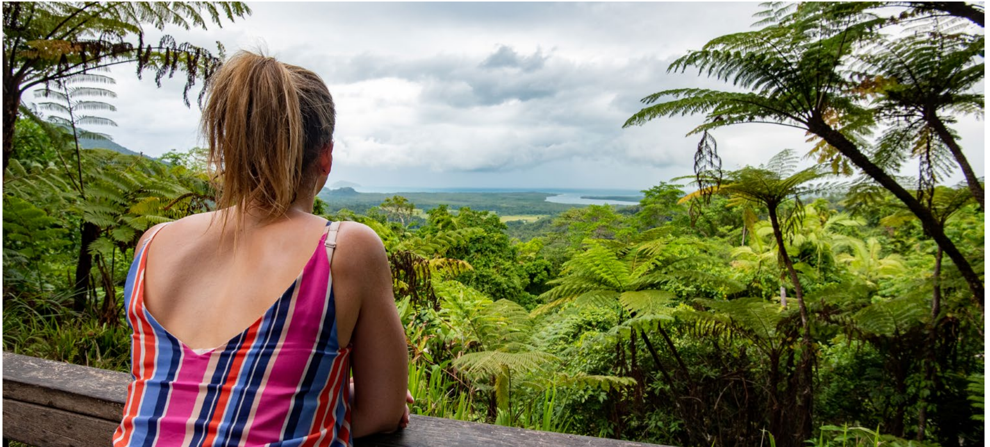
▲ Daintree National Park, Queensland

Responsible Business Manager Responsible Business Manager Responsible Business Manager