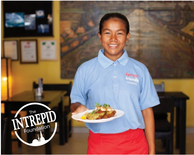
▲ Friends-International, Cambodia