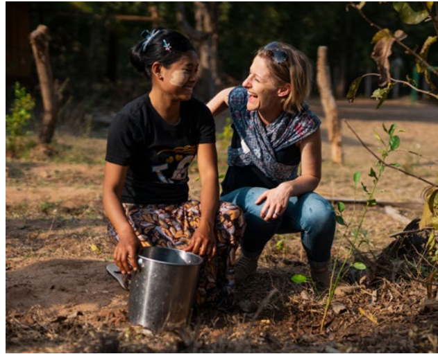
▲ Community-based tourism project, Myaing, Myanmar

In 2002, the not-for-profit arm of the business, The Intrepid Foundation, was established to encourage travellers to give back to the places and people they visit. The purpose of the Foundation is simple: to empower travellers to make a difference by supporting locally led, grassroots organisations that are working towards positive change in their communities. The Intrepid Foundation is committed to developing and maintaining long-term, mutually beneficial partnerships to support sustainable development outcomes.