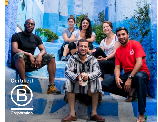
▲ Small group adventures in Chefchaouen, Morocco

We travel the local way – using local accommodation and transport, eating in local restaurants and employing local leaders, to ensure a larger share of tourism money stays where it belongs: in local pockets. This allows us to achieve a more authentic experience for our customers. We also enhance local employment by working with locals to establish community-based tourism projects (CBTs) across the world.